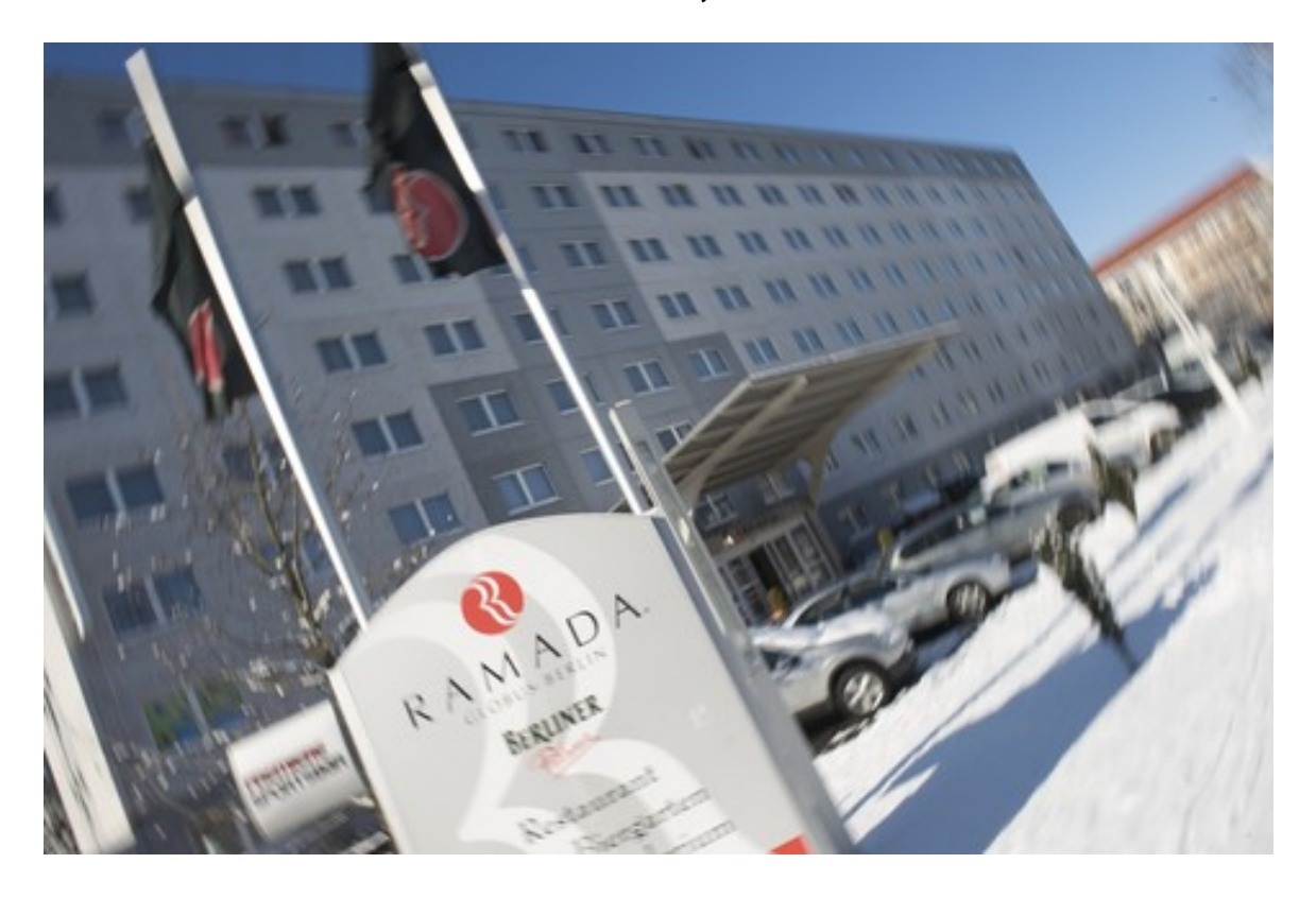
BCA City Comfort Hotels GmbH: Rhinstrasse 159, 10315 Berlin